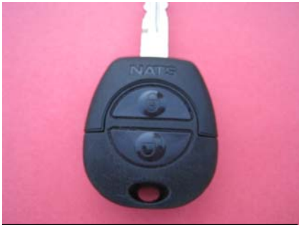
Your remote with new Silicone buttons is ready for use and no re-programming is needed.